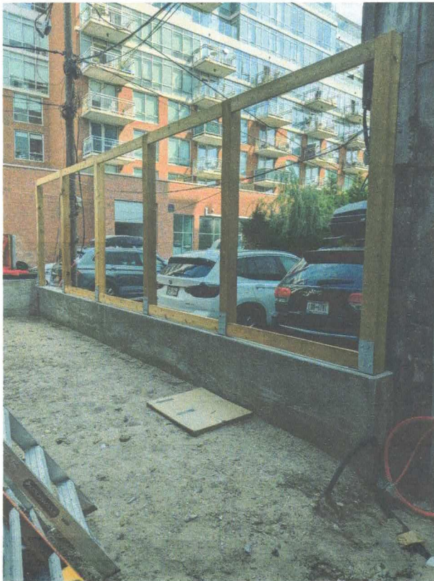
Before: September 23, 2025